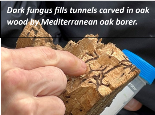
Dark fungus fills tunnels carved in oak wood by Mediterranean oak borer.

In recent years, MOB has been killing native oaks in Northern California. Late this summer the tiny insect was found infesting Oregon white oaks ( Quercus garryana ) in Wilsonville. In May, at least one Oregon white oak near Troutdale also found to be infested. These represent the first time this insect was confirmed from inside trees in the state, although since 2018 it had been caught in traps in Clackamas, Multnomah, Marion and Linn counties. So far, no other species have been found to be infested in Oregon. In California, a number of native oak species have been found to be infested. In their native Europe, North Africa and the Middle East, MOB is known to infest a long list of oak species.