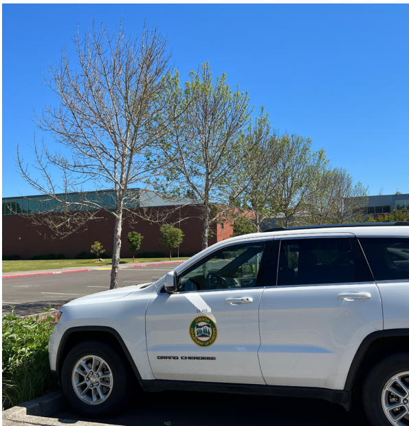
Ash trees at Joseph Gale Elementary School, the location where EAB was first detected in Forest Grove.

In 2022 Oregon's Invasive Species Hotline received 28 EAB reports & 7 were confirmed to be Emerald Ash Borer.