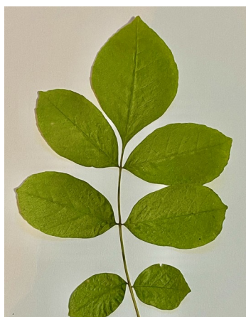
Oregon Ash leaf