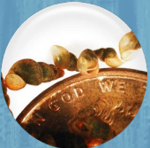
New Zealand Mudsnail