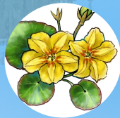
Yellow Floating Heart