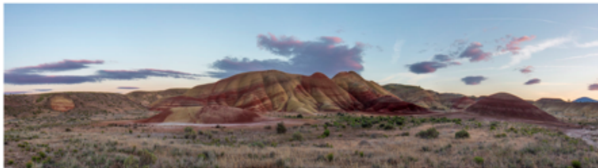
THE PAINTED HILLS, OREGON. AN IMPORTANT LANDSCAPE NEEDING PROTECTION FROM INVASIVE SPECIES.

by planning and leading a coordinated and comprehensive campaign to prevent, control, and eradicate, contain, or manage existing