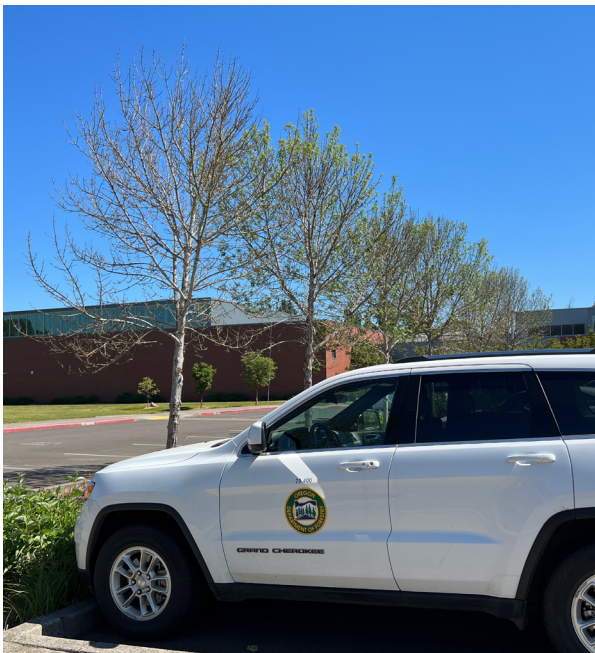
Ash trees at Joseph Gale Elementary School, the location where EAB was first detected in Forest Grove.

An EAB Task Force, with seven subcommittees, continues to meet monthly to share updates; plan strategically; develop outreach information such as extension bulletins, fact sheets, "look-alike" guides, and a monthly news bulletin; and implement and demonstrate techniques for inventorying ash populations, slowing ash mortality, and safely treating infested woody material. OISC provides administrative support to the EAB Task Force and uses its website as an EAB response resource.