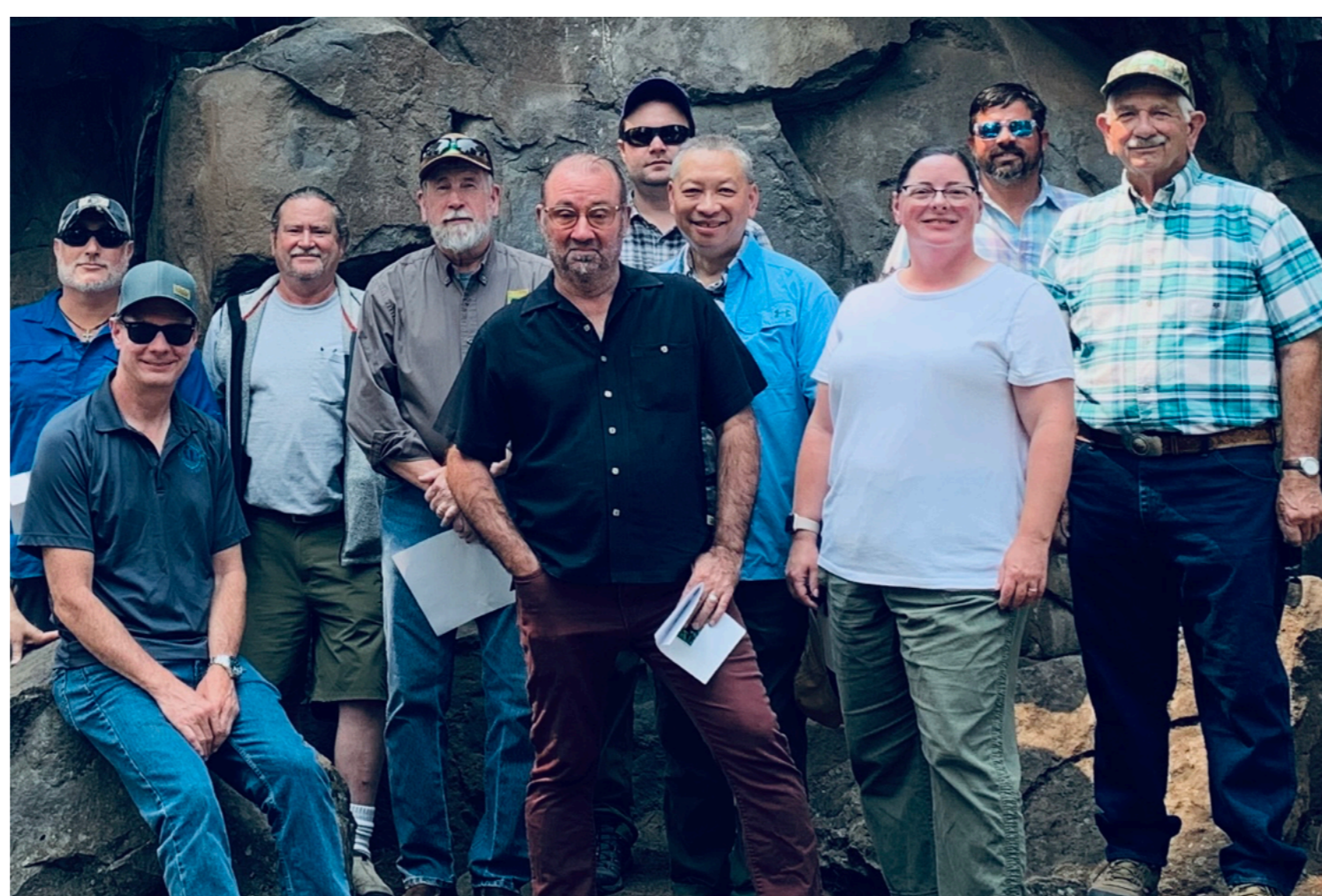
The OISC on a field site visit to the Deschutes in August, 2023.

We're testing out a new look and a new strategy for keeping the Oregon Invasive Species Network (OISN) Network up-to-date with goings on with the Oregon Invasive Species Council (OISC) and in the world of invasive species. OISN updates will be curated into a monthly newsletter sent out via Mailchimp with more time critical updates and OISC meeting information sent out as needed via our new GoogleGroup . These will replace the older OISC Network distribution list you were subscribed to. You can change your subscription to this newsletter via the link at the bottom of this email. GoogleGroup preferences can be found here . Thank you for your patience during this transition.